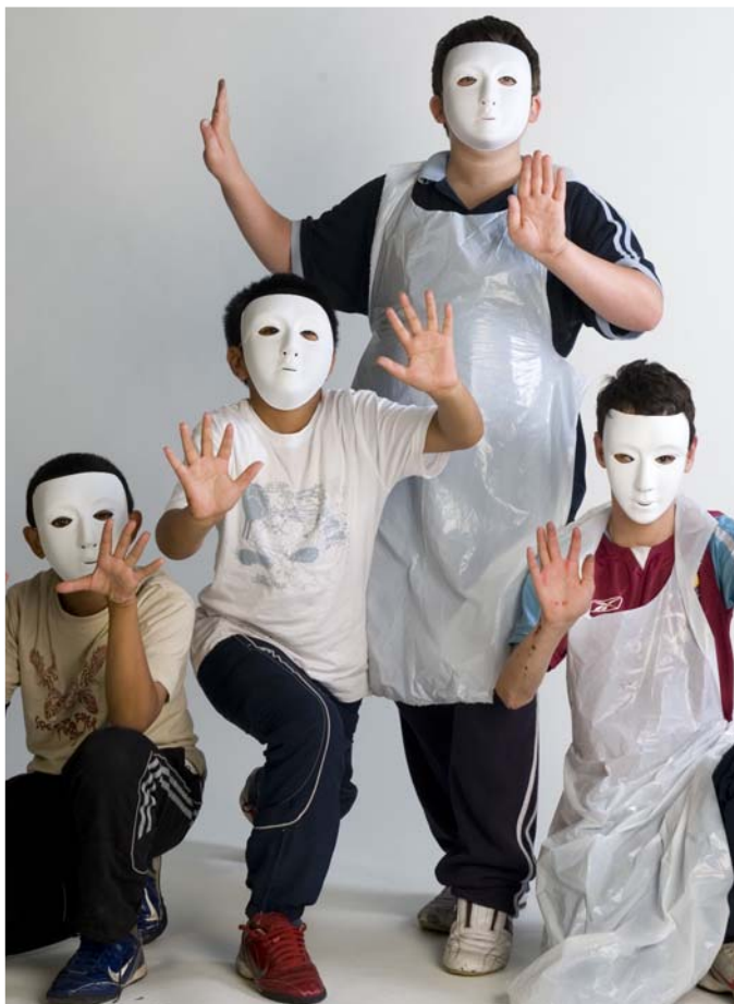
The Conflict and Change project, Newham, is a grant recipient of the City Bridge Trust, which aims to address disadvantage by supporting charitable activity across Greater London through quality grant-making and related activities with clearly defined priorities. The trust is currently reviewing its web presence with a view to employing social media tools.