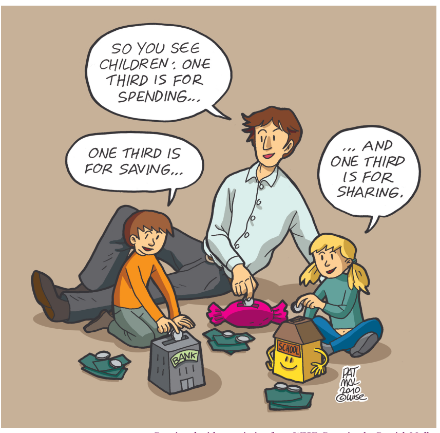
Reprinted with permission from WISE. Drawing by Patrick Mallet

is superior to that of other businesses. Their strength and differentiating factors lie in the fact that they develop a long-term vision and invest more in the training of their staff than other companies. These are some of the values transmitted to the next generation through philanthropy: have a long-term vision for the future and invest in people.