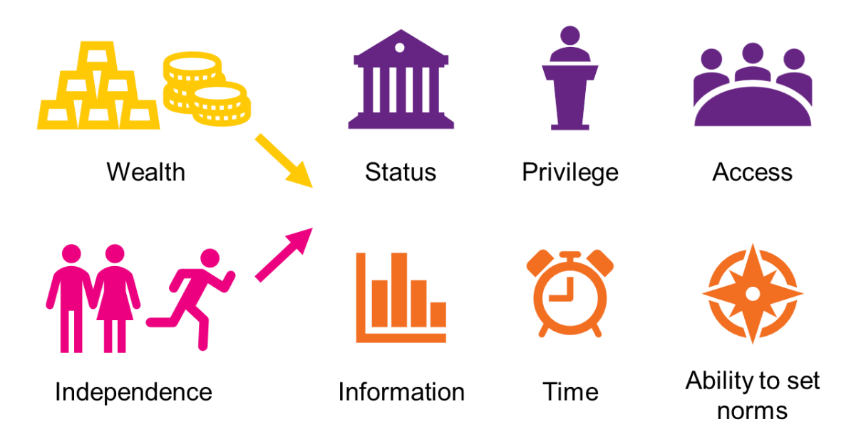
Figure 3: Sources and types of funder power

Wealth : Wealth is the most obvious source of your power as a funder. Your balance sheet—or that of your organisation—underpins everything that you do. Your wealth translates most obviously into power through your ability to make or withhold grants and investments. Charitable foundations in the UK gave an estimated £6.5 billion in grants in 2017/18.<sup>14</sup> There is arguably no greater expression of a power imbalance than a group of people with money and resources voluntarily agreeing to transfer them to people in need of money and resources. As a funder, the harsh reality is that you effectively pull the strings of people's livelihoods and the things that they get to work on.